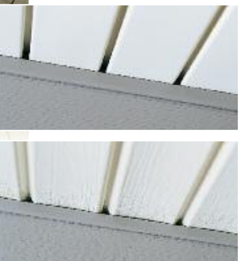
Extra rigid Charter Oak stays flat, providing outstanding appearance and quality, year after year (top). Ordinary soffit lacks stiffness, so it tends to cup when installed (lower).