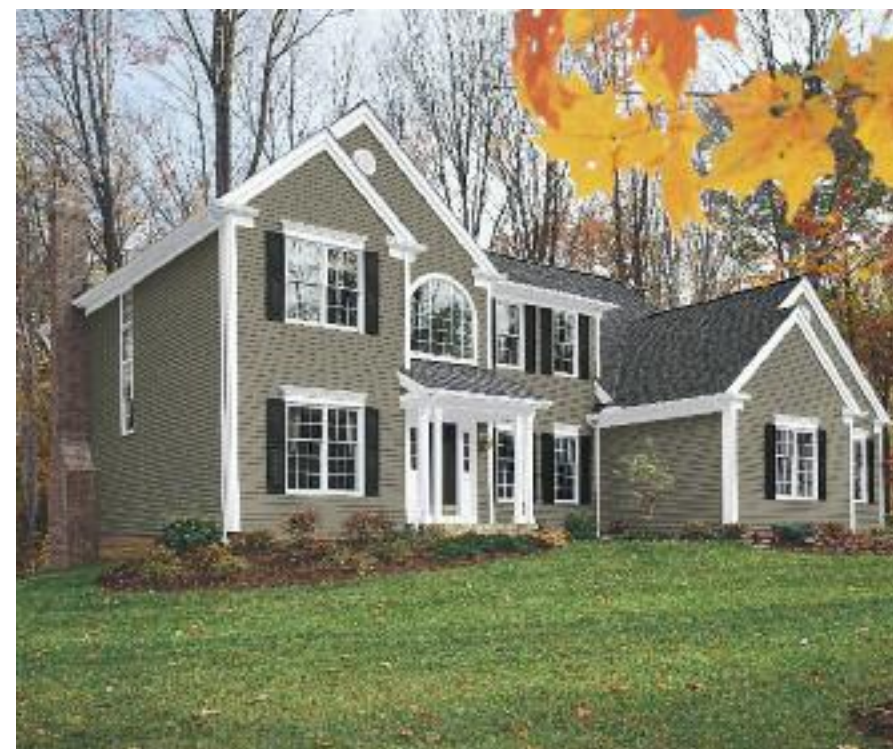
Dramatic contrast. Slate siding, Glacier White trim, Black shutters and door.