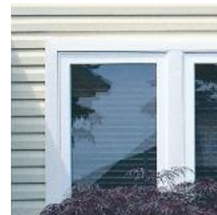
Charter Oak dutch lap with Trimworks 3 1/2" window trim.