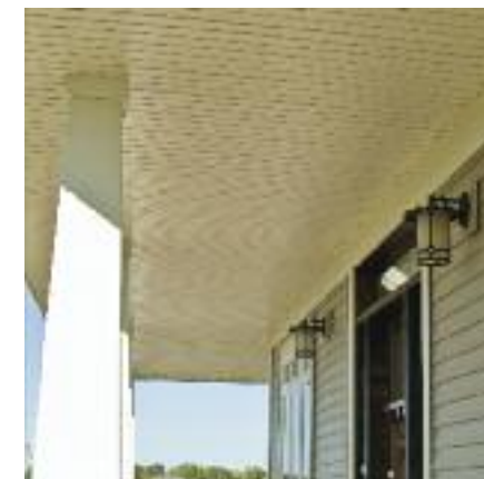
Charter Oak invisibly-vented soffit.