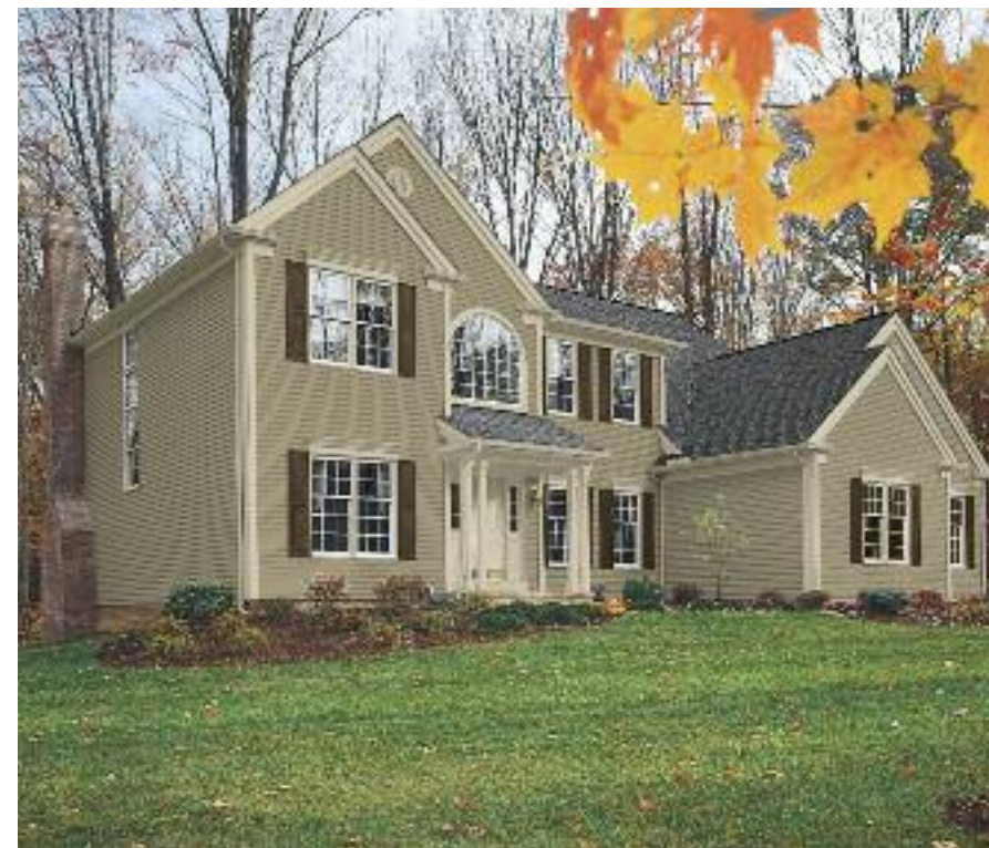
Subtle contrast. Tuscan Clay siding, Monterey Sand trim and door, Brown shutters.

Want a great way to view Alside siding, accent and trim color combinations? Alside's Design Showcase is an interactive color visualization tool that makes choosing siding, accent and trim colors easy, effective and exciting . . . all with just a click of the mouse. Visit www.alside.com to get started.