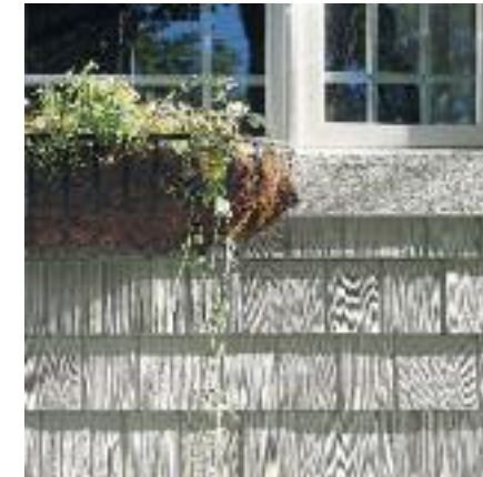
Aside Premium Shakes – the classic look of deep-grained cedar shakes.