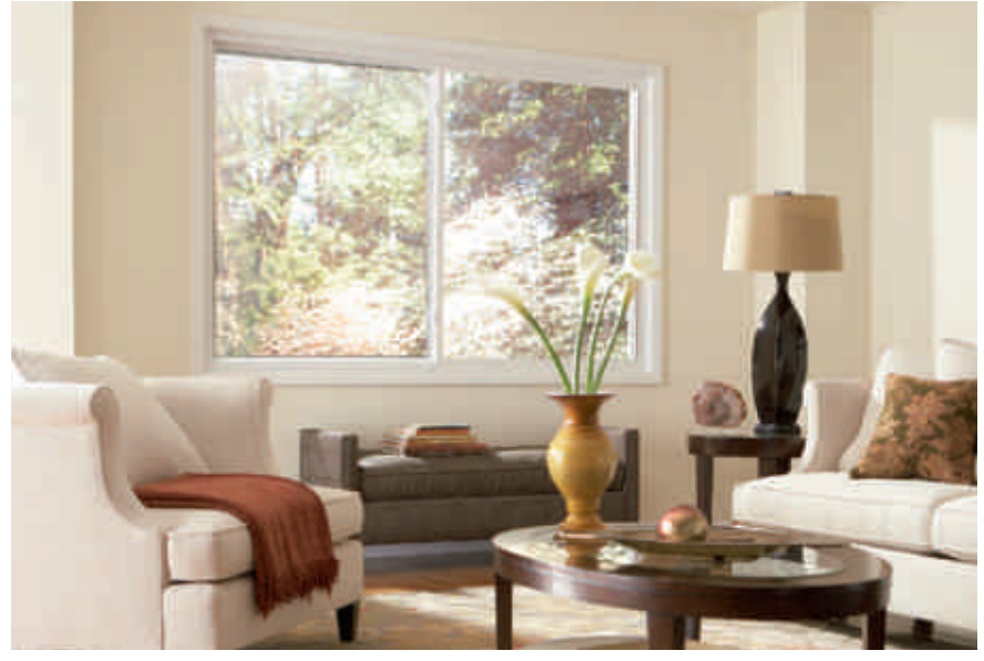
Above Top: Fusion Double-Hung Windows feature a constant force balance system to ensure smooth operation; both sashes tilt in for convenient cleaning from inside your home. Above: Fusion Sliding Windows glide horizontally on a nylon-encased dual brass roller system, and the sashes lift out for easy cleaning.